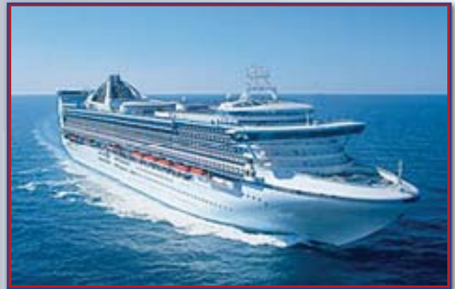
Enjoy the amenities on the Grand Princess.

We would like to congratulate everyone participating in this year's travel incentive for achieving their goal and wish them all a "Bon Voyage"!