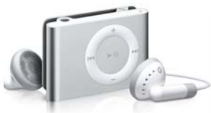
PartSource 618 Wharncliffe