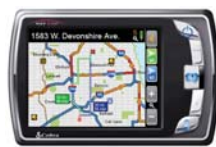
Motion Auto Parts