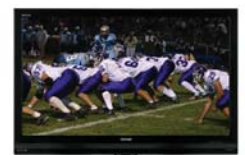
H.G. Bradley & Sons